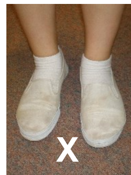
Fabric Shoes NOT Acceptable for school or sport