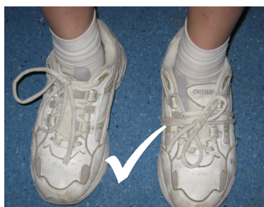
Supportive leather lace-ups white Acceptable