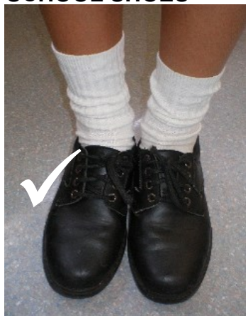
Covered leather upper Acceptable