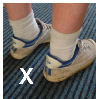
Dunlop Volley NOT Acceptable