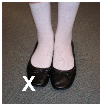
Ballet Style NOT Acceptable