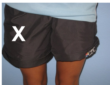
Shorts folded or rolled up NOT Acceptable