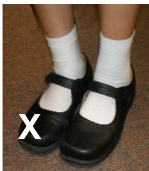
Mary Jane NOT Acceptable