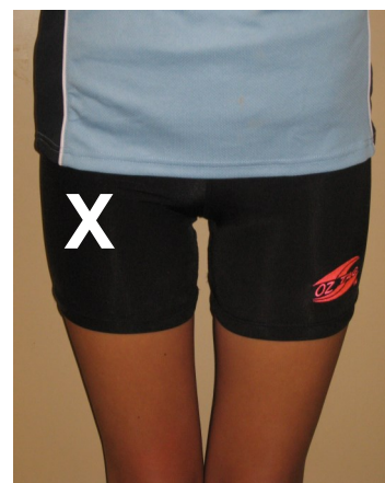
Tights, bike pants or oztag shorts NOT Acceptable