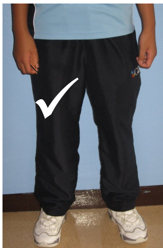
Navy microfibre shorts with emblem OR Navy microfibre trackpants with emblem Acceptable